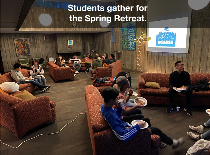
Students gather for the Spring Retreat.